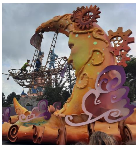
Watching the Parade