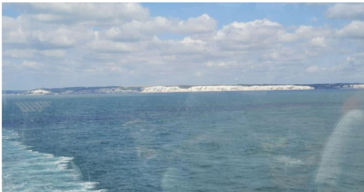
The White Cliffs of Dover

We left Manchester at 1:30 am, ready for the long journey to Paris. Despite travelling overnight, a lot of the Brownies were too excited to sleep! We arrived at Dover to catch the ferry to Calais which was a new experience for many of the Brownies – it was a lovely morning so we were able to sit on the deck for the journey and could see the White Cliffs of Dover as we left England. After arriving at PGL, we had time for a tour before dinner and our evening activity, which was making traditional French crepes!