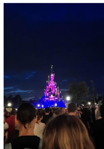
Waiting for the Fireworks!

Taking part in this trip has inspired me to explore more international opportunities with Girlguiding, including IntOps or GOLD, and I would love to go on an international trip with my unit again in the future!