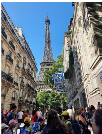
Arriving at the Eiffel Tower