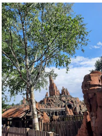
Big Thunder Mountain

The next day was our trip to Disneyland, which was the highlight of the trip for many of the members (and the leaders!) We had a packed day, including going on rides, watching the parade, getting character autographs and seeing the Grand Orchestra perform. There was also time to stop for some Mickey shaped pizzas, and a trip to the gift shop. The Brownies particularly loved the Pirates of the Caribbean ride, which we went on three times in a row! Our day ended with the amazing fireworks and drone show, which was the perfect way to finish our trip.